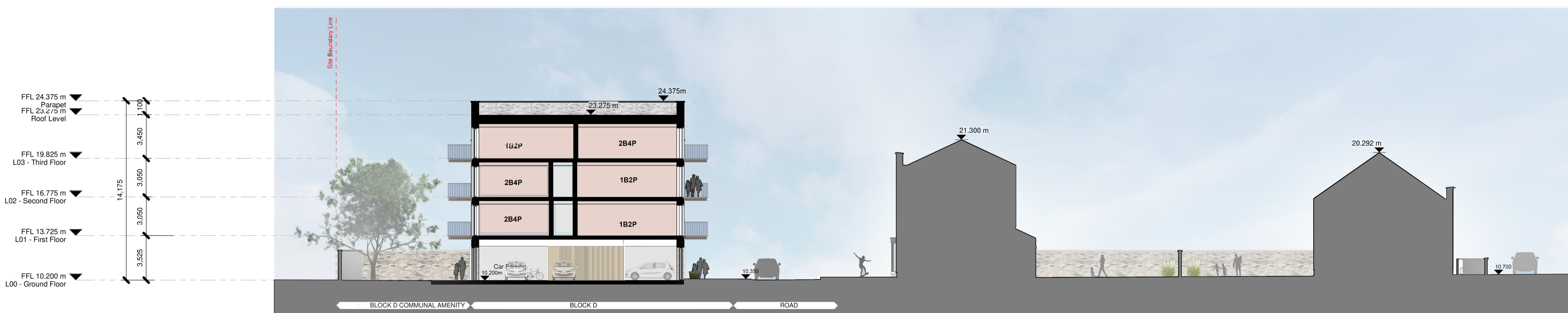
Section C-C Scale:1:200