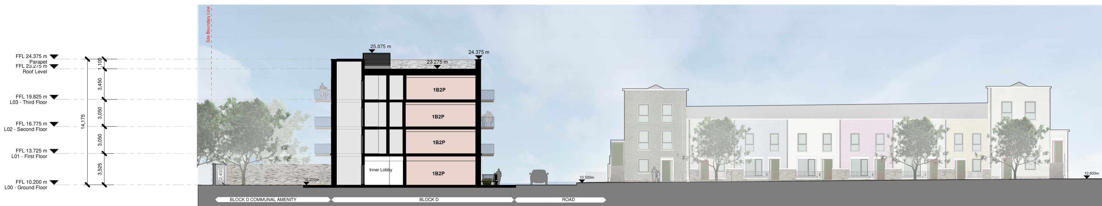
Section B-B Scale:1:200